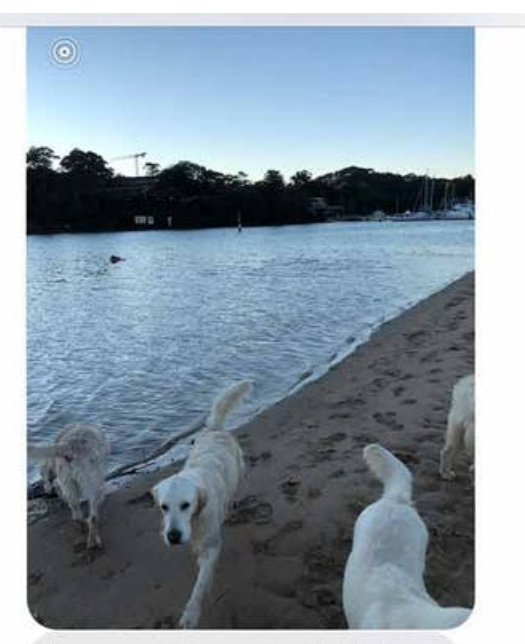
Dozer out to sea on lockdown

The last update from the Golden Retriever Boarder while in Tassie!